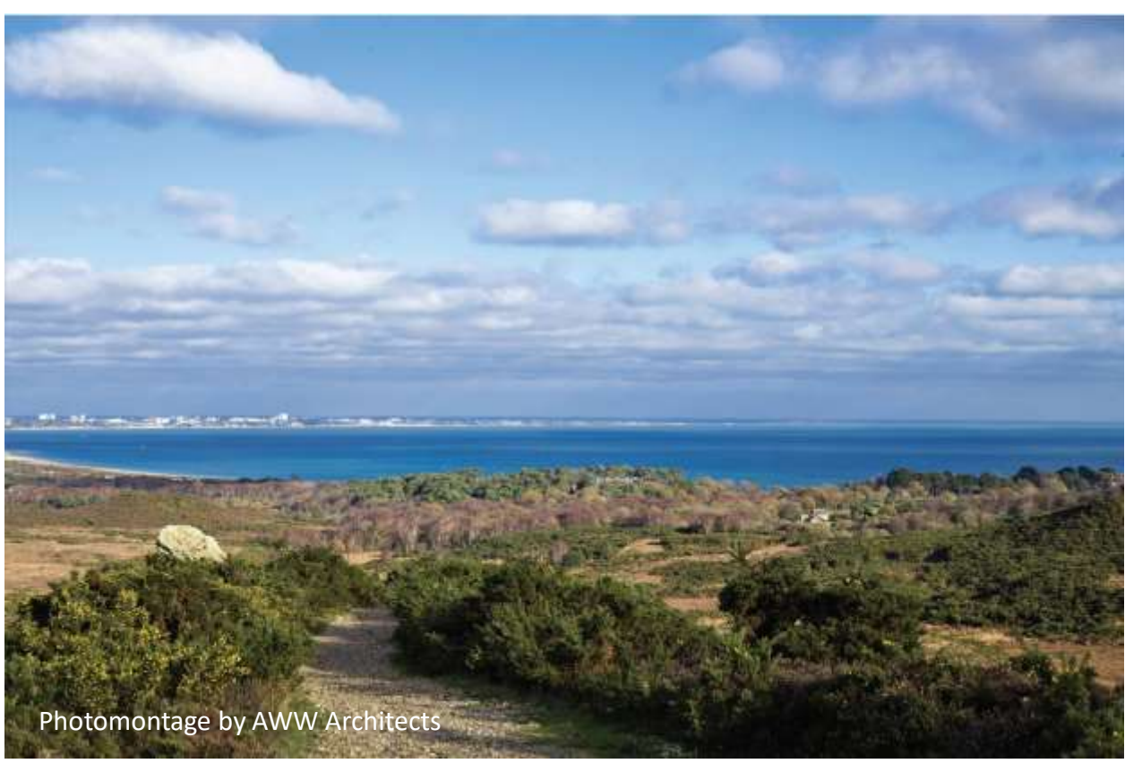
Viewpoint 6 - Proposed Scheme