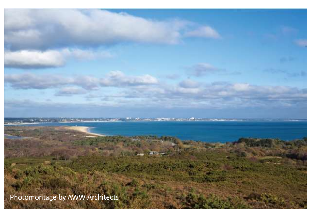
Viewpoint 5b - Proposed Scheme