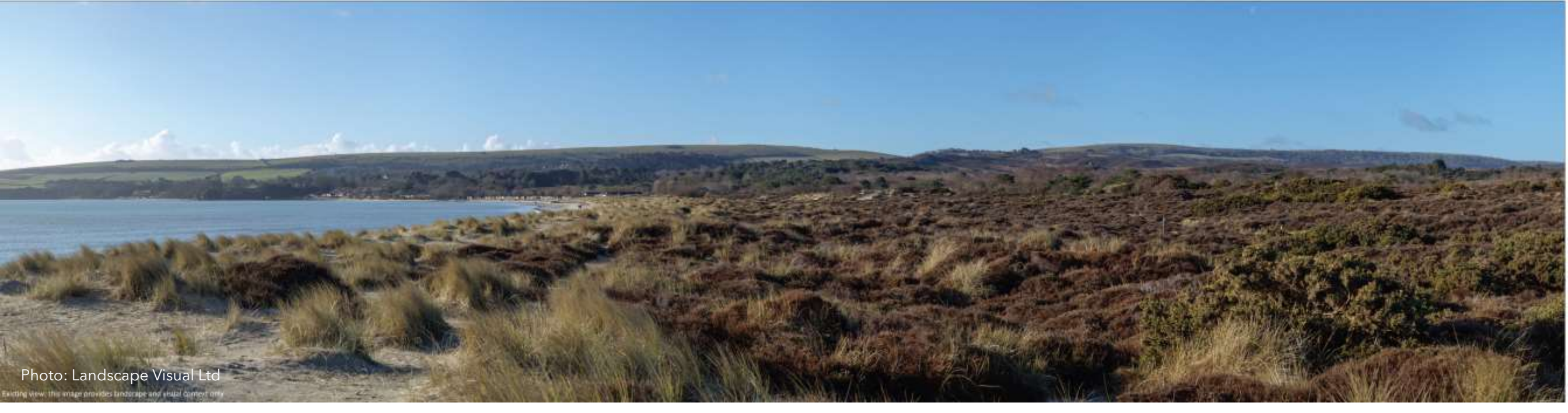
Viewpoint 8 - Baseline Condition