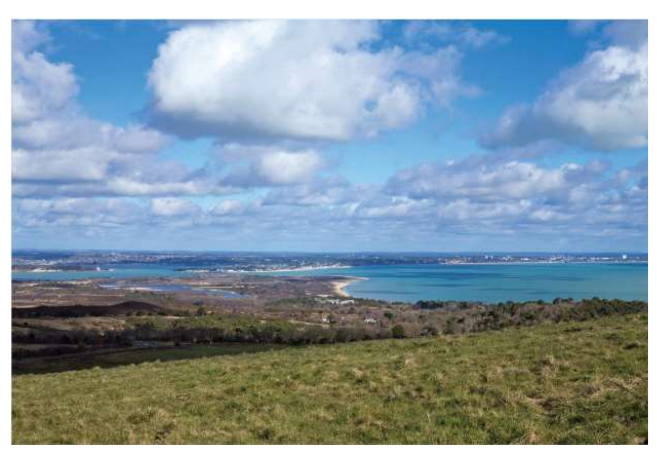
Viewpoint 9 - Previous Scheme