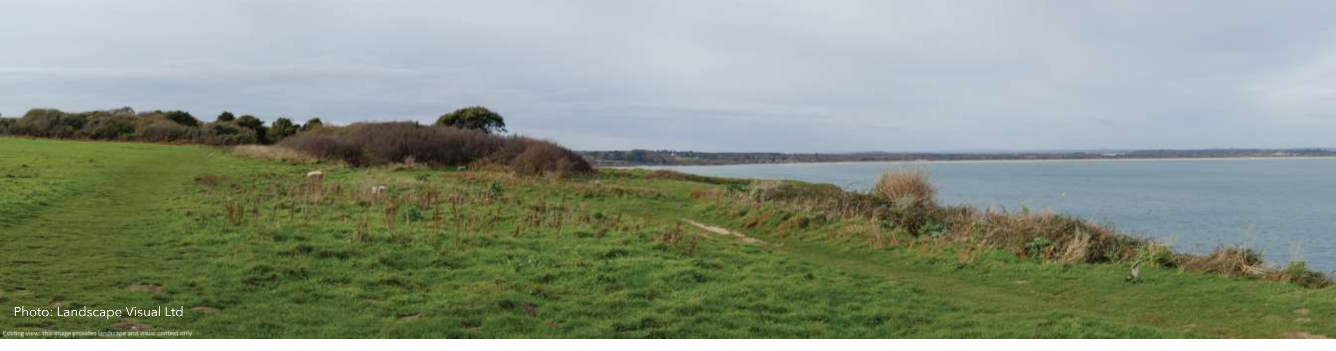
Viewpoint 8 - Baseline Condition