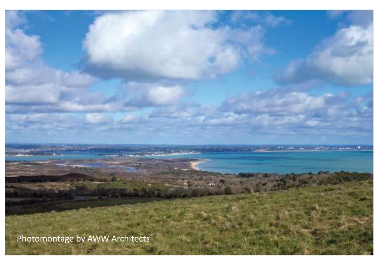
Viewpoint 9 - Proposed Scheme