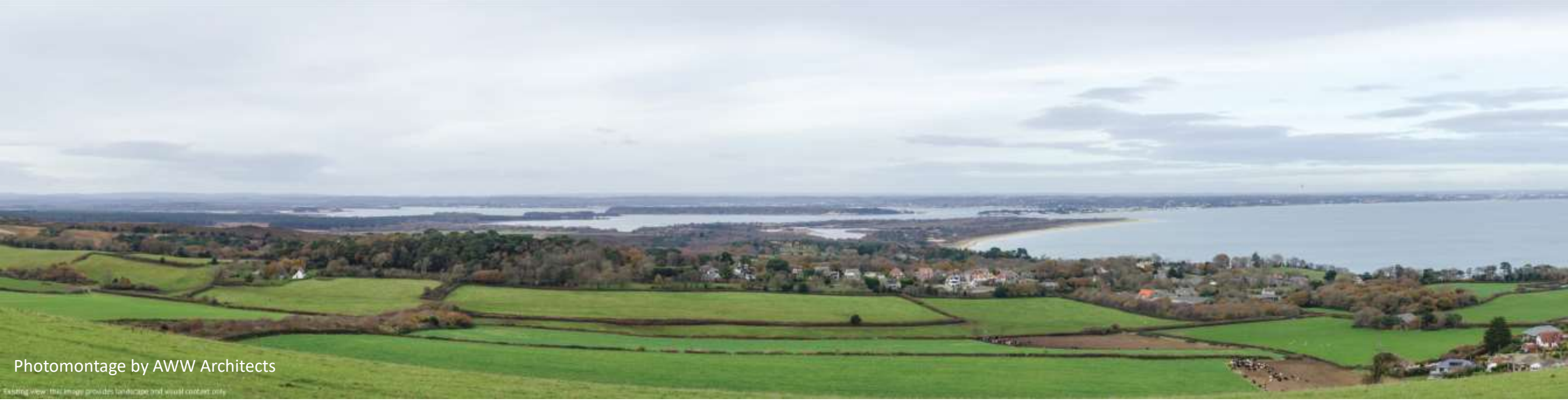
Viewpoint 7b - Proposed Scheme