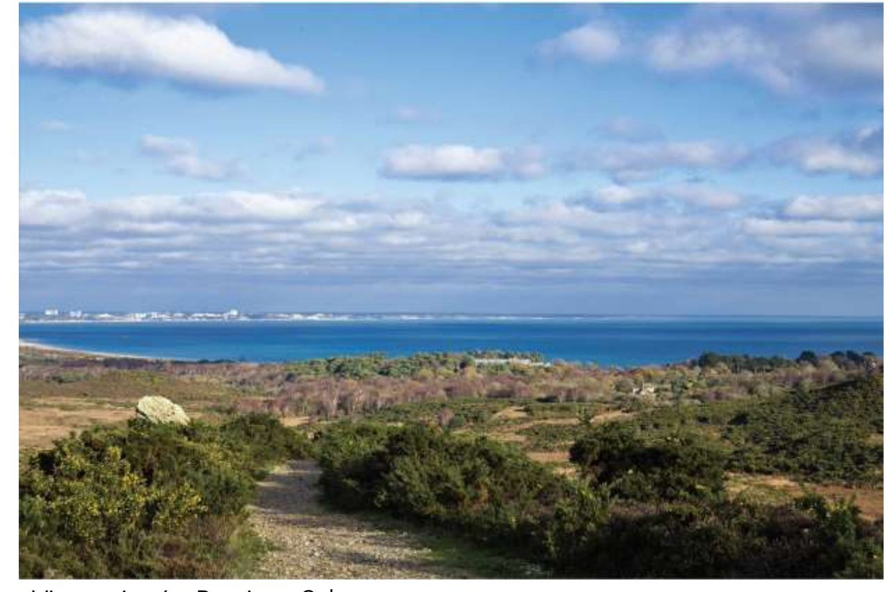
Viewpoint 6 - Previous Scheme