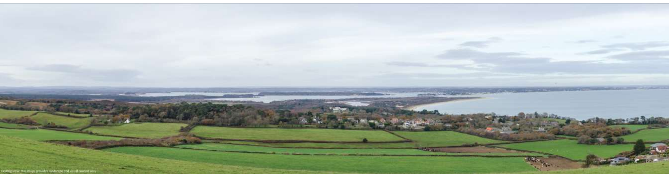
Viewpoint 7b - Previous Scheme